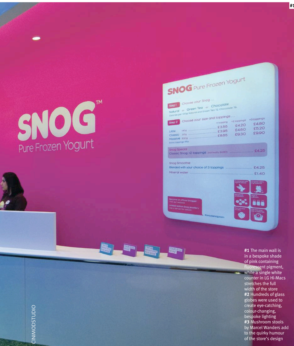
#1 The main wall is in a bespoke shade of pink containing fluorescent pigment, while a single white counter in LG Hi-Macs stretches the full width of the store #2 Hundreds of glass globes were used to create eye-catching, colour-changing, bespoke lighting #3 Mushroom stools by Marcel Wanders add to the quirky humour of the store's design

➤ This second branch of cheekily named frozen yogurt bar Snog fits perfectly with Westminster Council's mission to promote a more salubrious side of Soho to those who visit London for the 2012 Olympics.