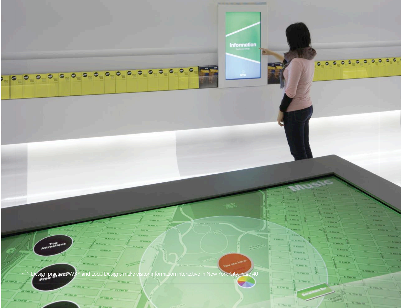
Design practices WXY and Local Designs make visitor information interactive in New York City. Page 40

140 IF ONLY... building could be less rigid, says Trahan Associates in Baton Rouge